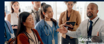
Level 6 Chartered Manager Degree (Health) Apprenticeship